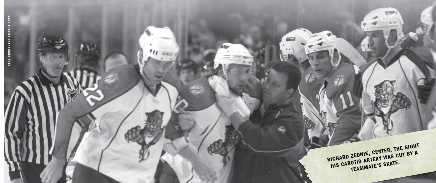
RICHARD ZEDNIK, CENTER, THE NIGHT HIS CAROTID ARTERY WAS CUT BY A TEAMMATE’S SKATE.